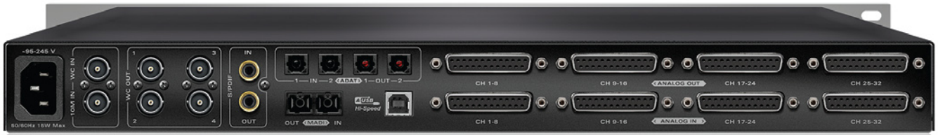
The huge analogue channel count is accommodated via D-sub connectors on the rear panel, as it would be impossible to fit in enough jacks or XLRs. There are impressive digital I/O options, too.

» independently in 1dB increments between -20dBFS and -14dBFS. The former is the default setting and the SMPTE standard, while -18dBFS is the EBU standard. The final options are for adjusting the ASIO buffer size (64 to 8192 samples) and streaming mode (minimum or low latency, standard, relaxed, safe and extra safe!).